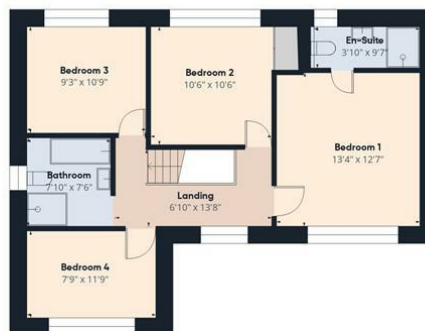
First Floor Building 1